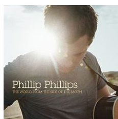
Pictured above: Both Trilogy and The World

There have been many great music releases in the past month. Here are a few of the standouts: